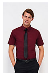
SOL'S BROADWAY 17030